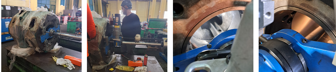
The re machining activities were performed by CPI France at our customer's premises, in Ivory Coast

This intervention significantly reinforced CPI's reputation with both the client and its local subcontractors, demonstrating CPI's ability to deliver a technically reliable and fast on site solution in Ivory Coast—even under challenging supply chain and logistical constraints.